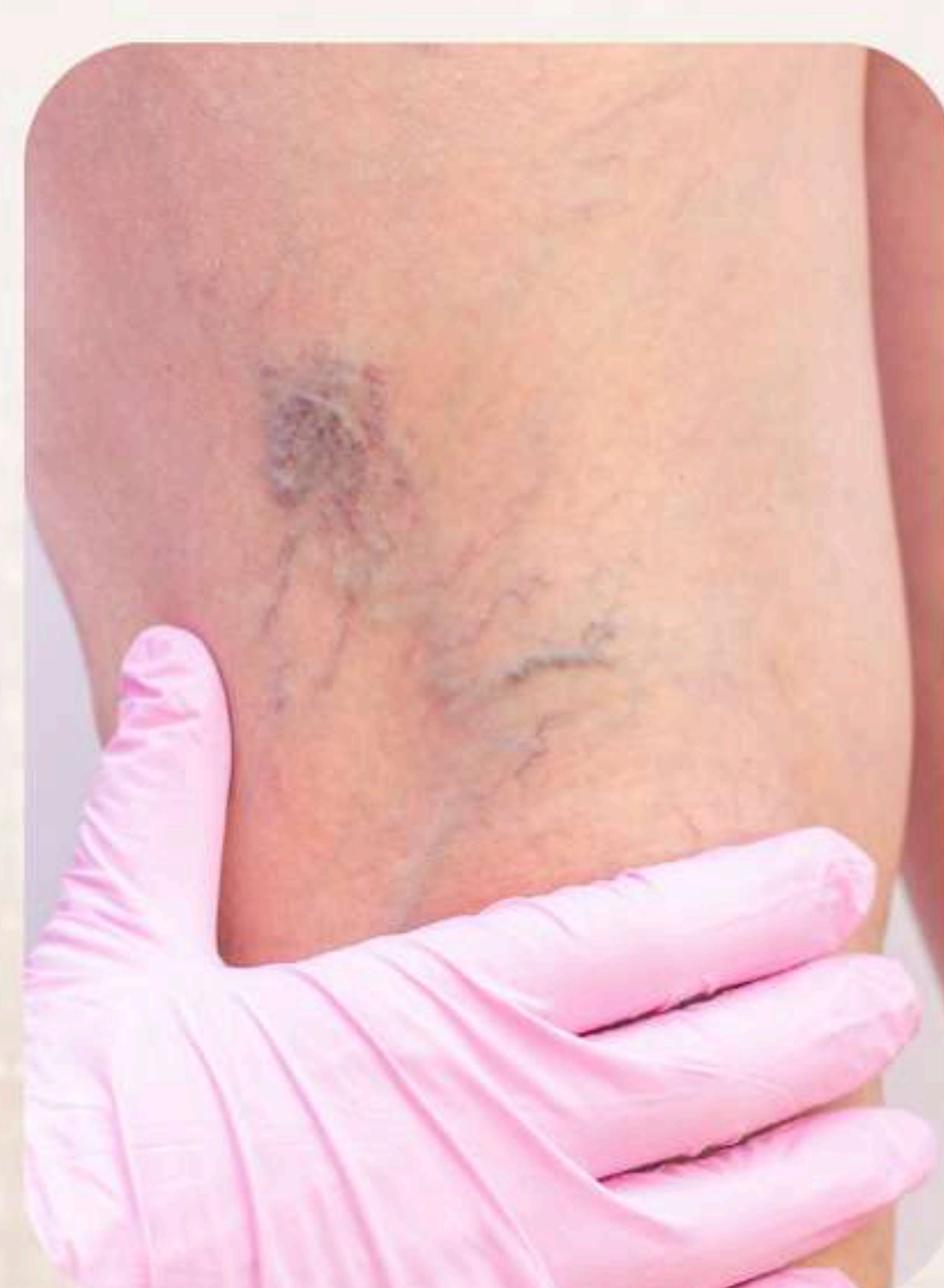
Vascular Lesion Removal