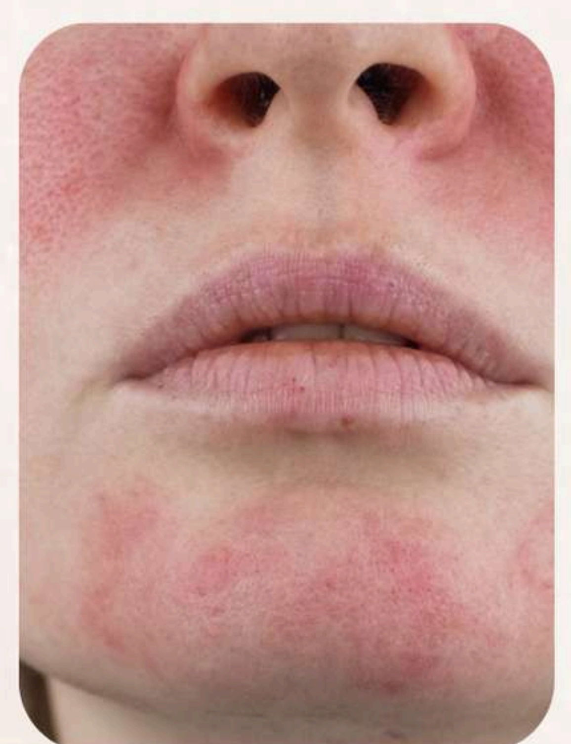
Correction of Rosacea, Redness & Skin Sensitivity